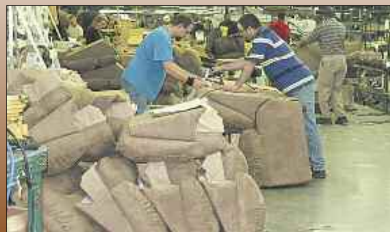
Franklin Corporation produces all types of furniture (top right), such as the recliners and chairs shown here. The Gerber Cutter (bottom right) is used to cut the upholstery for the products. Two employees work hard to complete the production of a beautiful suede couch.